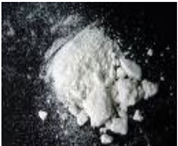
This substance above is only a small dosage of crack cocaine compared to the approximate millions of dollars worth that was generated around Pittsburgh.